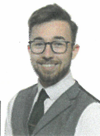
Mr Sault Chase College