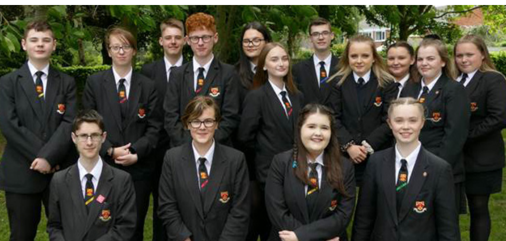
The Senior Student Team